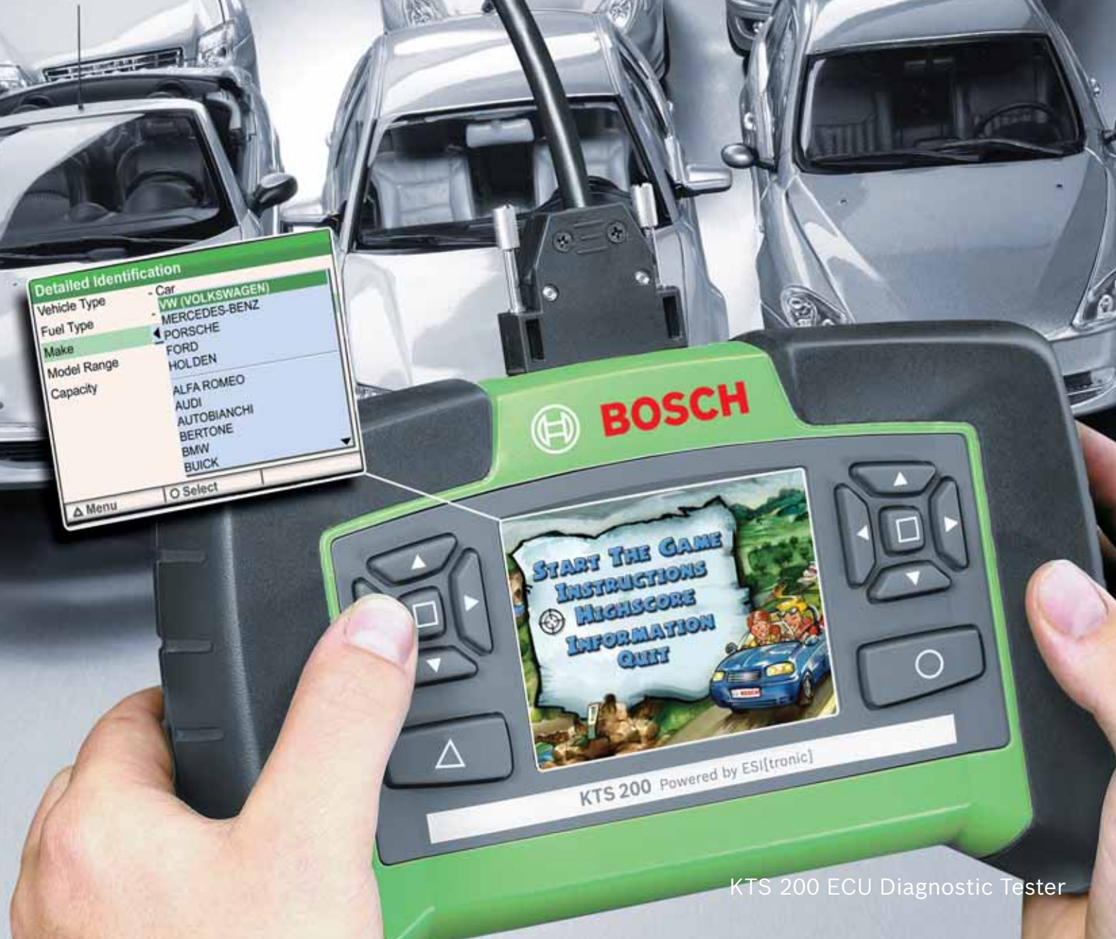
KTS 200 ECU Diagnostic Tester